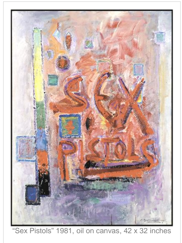
"Sex Pistols" 1981, oil on canvas, 42 x 32 inches

In the 1960s Burkhardt was the subject of museum retrospectives at San Diego Art Institute and San Diego Museum of Art and afforded a 30 year retrospective exhibition at the Santa Barbara Museum, San Francisco's Palace of the Legion of Honor and Los Angeles Municipal Art Gallery.